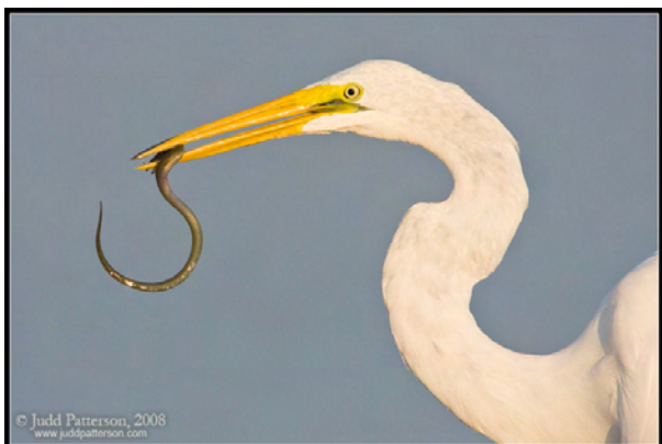
(Top row: Western Sandpiper, American Oystercatcher) (Bottom row: Semipalmated Plover, Great Egret with eel)