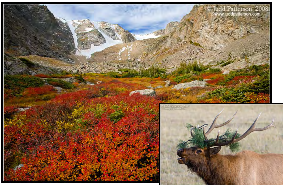
Subalpine Fall Colors and a Stylish Bugling Elk, Rocky Mountain National Park

In late September my job sent me to Colorado, and I was able to spend a few extra days hiking and taking photographs in Rocky Mountain National Park. I'll admit that it took a while to fully transition from southern Florida (hot, humid, and just barely above sea level), but I had a wonderful time.