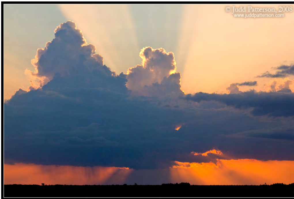
Rays of Rain, Everglades National Park

Welcome! You are reading the first edition of my nature photography newsletter. My goal is to provide occasional updates to show recent photographs and to share information about travel and exhibits.