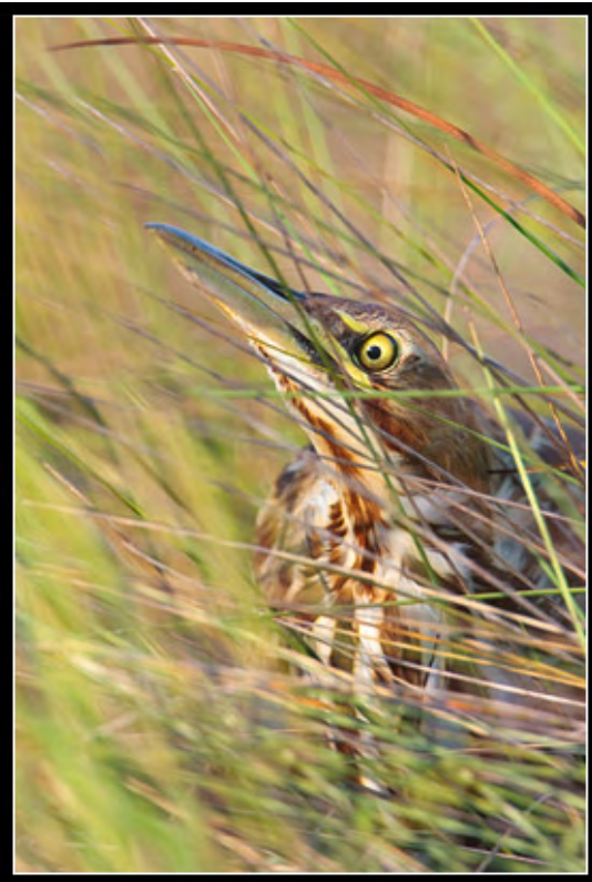
Left: Wild American Flamingo (Cutler Bay, FL) Right: American Bittern sways in the sawgrass (Everglades National Park)