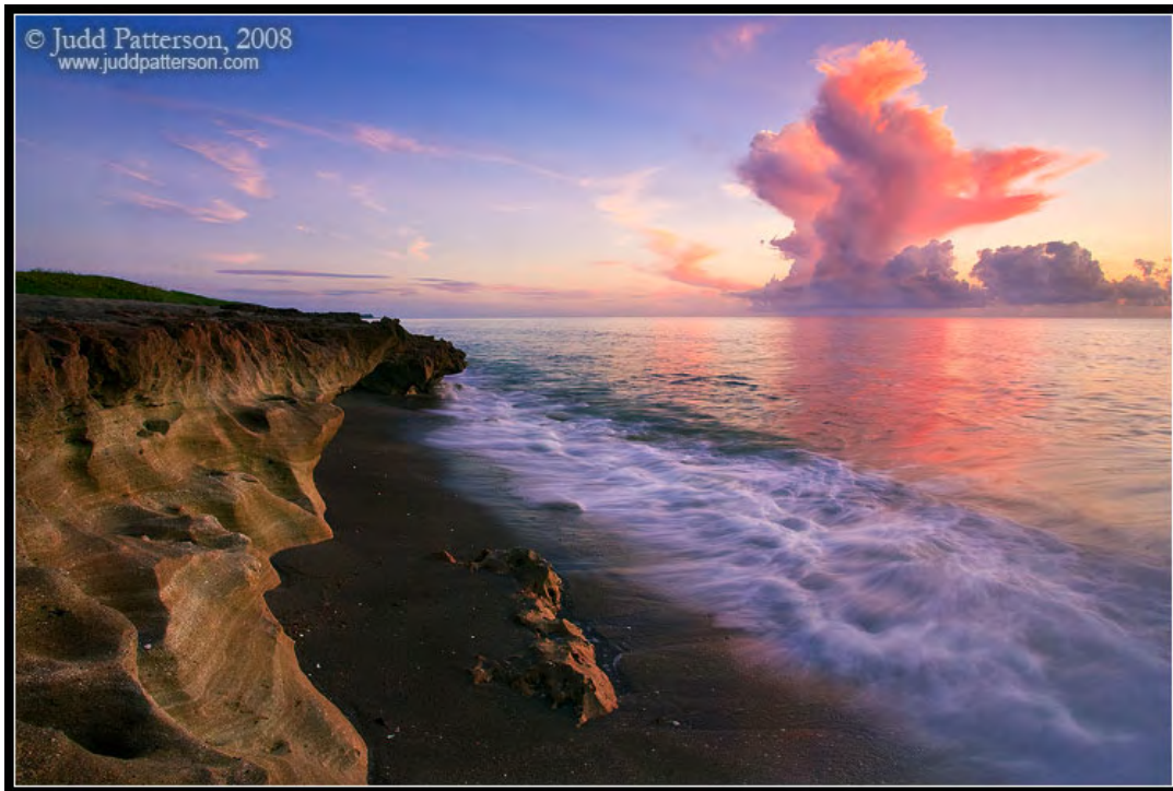
Dawn Thunderstorm, Blowing Rocks Preserve (Jupiter, FL)

“Everybody needs beauty as well as bread, places to play in and pray in where nature may heal and cheer and give strength to the body and soul.” —John Muir